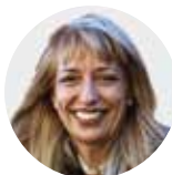
Baroness Susan Greenfield

The wonderful thing about being a human being is that although we are born with a full complement of brain cells, it is the growth of connections between the cells that accounts for the growth of the brain after birth. These connections reflect the unique sequence, - a life-story, of individual experiences and interactions with the outside world: a phenomenon known as 'plasticity' that leads to the personalisation of the physical brain, amounting to a 'mind'. Given the unprecedented challenges posed by the digital world to emotions and well-being, we need to devise the best ways for optimising fulfilment of each individual's potential with a correspondingly new type of leadership.